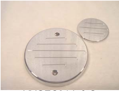
VVGEC04-L & S