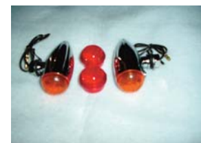
Super bright LED's