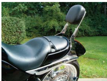
Mounted Hammer or Jackpot Sissy Bar

VVGBR04 Vegas / Kingpin Sissy Bar Rack $ 184.00 VHMBR05 Hammer / Jackpot Rack $ 184.00 VVGJR06 Vegas Jump Rack $ 147.00